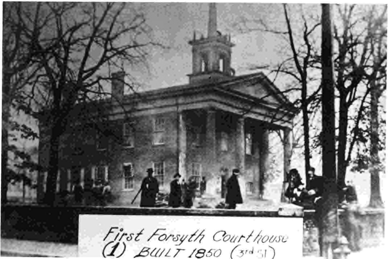
THE FIRST FORSYTH COUNTY COURTHOUSE