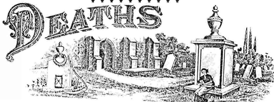
GRAPHIC FROM OLD FAMILY BIBLE RECORD PAGE. #1#